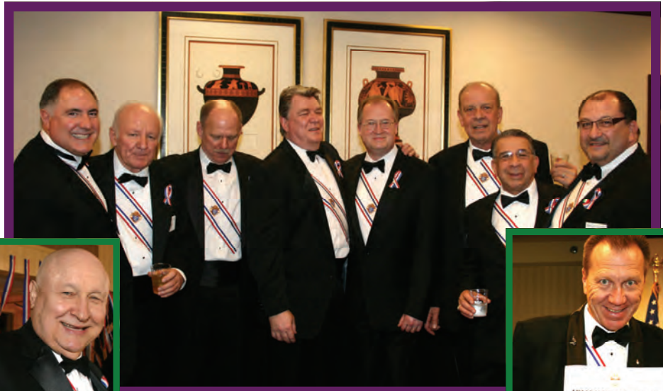
Fourth Degree Exemplification, Marriott Lincolnshire April 9, 2011