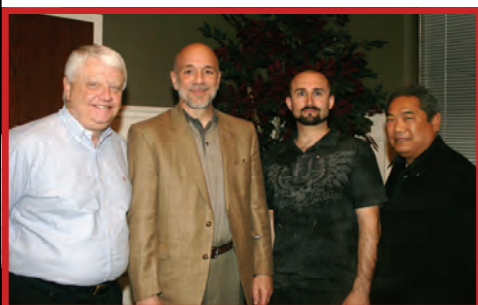
New 3rd Degree Knights