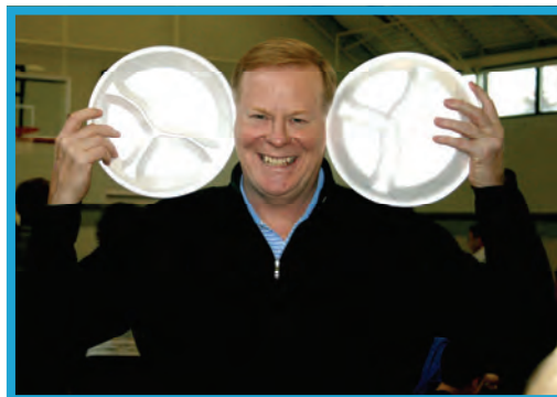
Lenten Fish Fry Fridays "My what big ears you have!!"