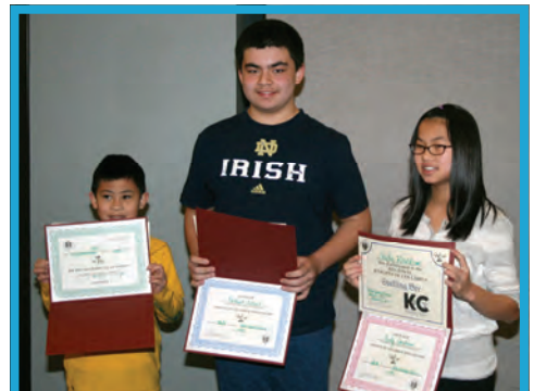
Holy Family Council Regional Spelling Bee Winners