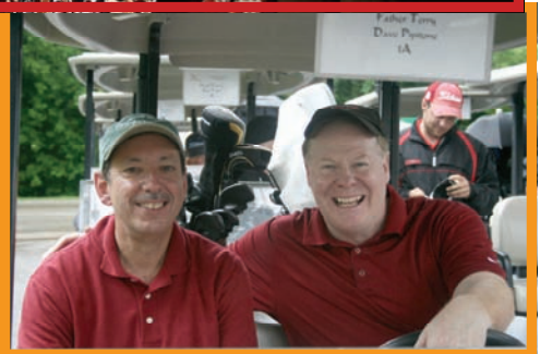
Top and Center: Council 11981 and Ladies Auxiliary Officer Installations, Emmetts, June 29, 2011. Bottom Left: Yellow Ribbon Support Group Care Package Program, Holy Family, May 14/15, 2011. Bottom Right: Red Shirt golfers, Holy Family Golf Outing, Chalet Hills G.C., Cary, June 27, 2011.