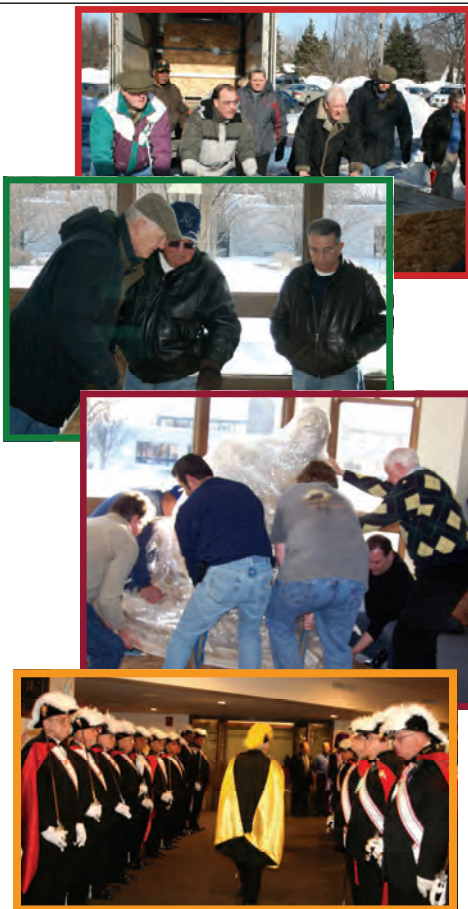
Knights Deliver/Support La Pieta