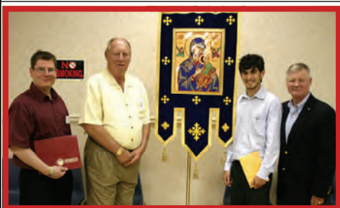
New 3rd Degree Knights